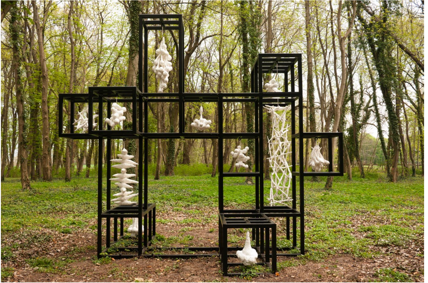
Land Art Schlosspark Wagenitz Cosmos on a clearing of the Schlosspark Wagenitz 2014/15, size approx. 420 x 400 x 280 cm, various all-wheater materials