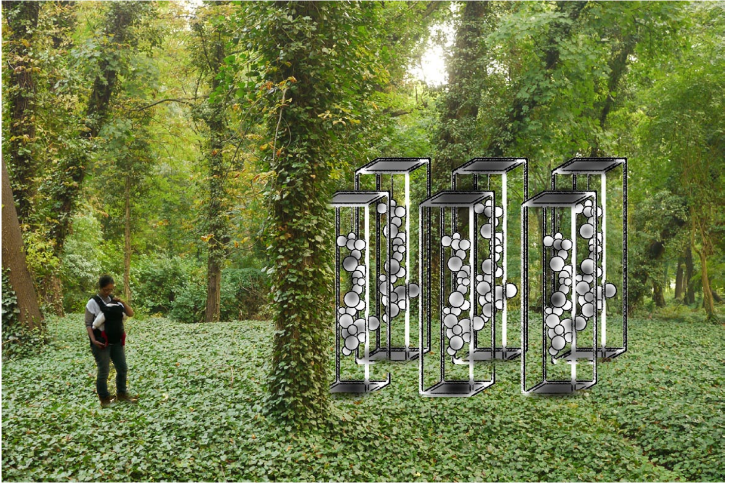
Takayuki Daikoku Design of a freestanding ensemble of outdoor sculptures at Schlosspark Wagenitz, 2013