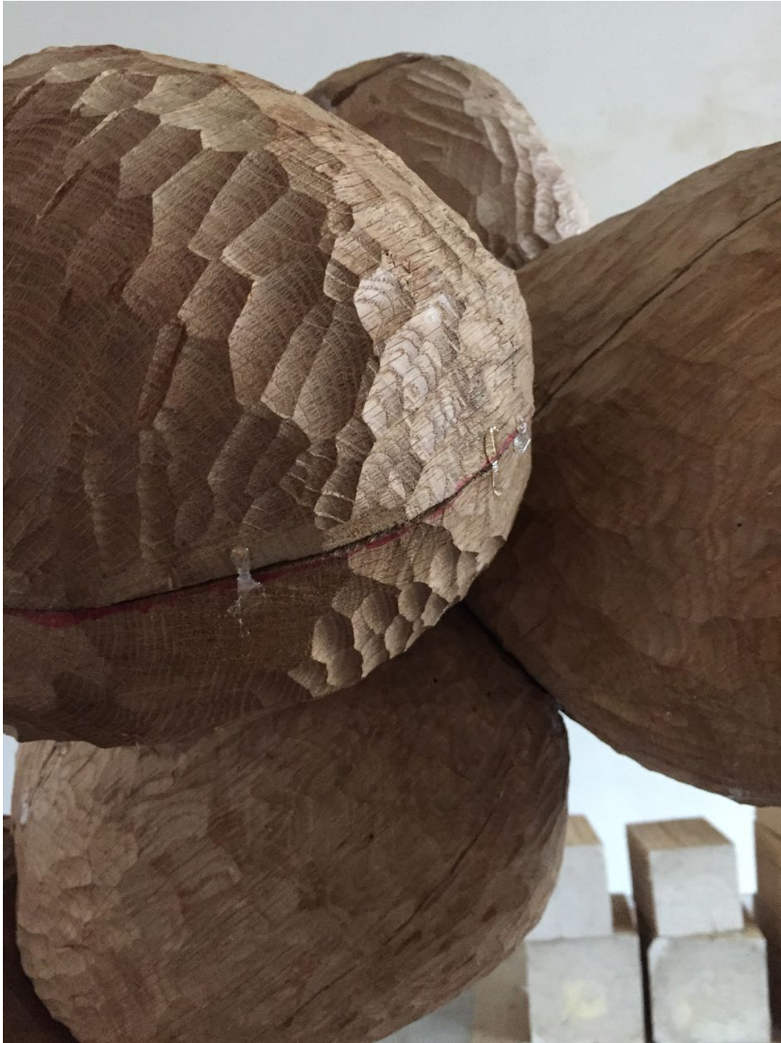
Takayuki Daikoku Detailed view of woodcell (production process), oak In the background: oak wood blocs from the region for the single elements of the sculpture; photo: Semjon H. N. Semjon, Januar 2015