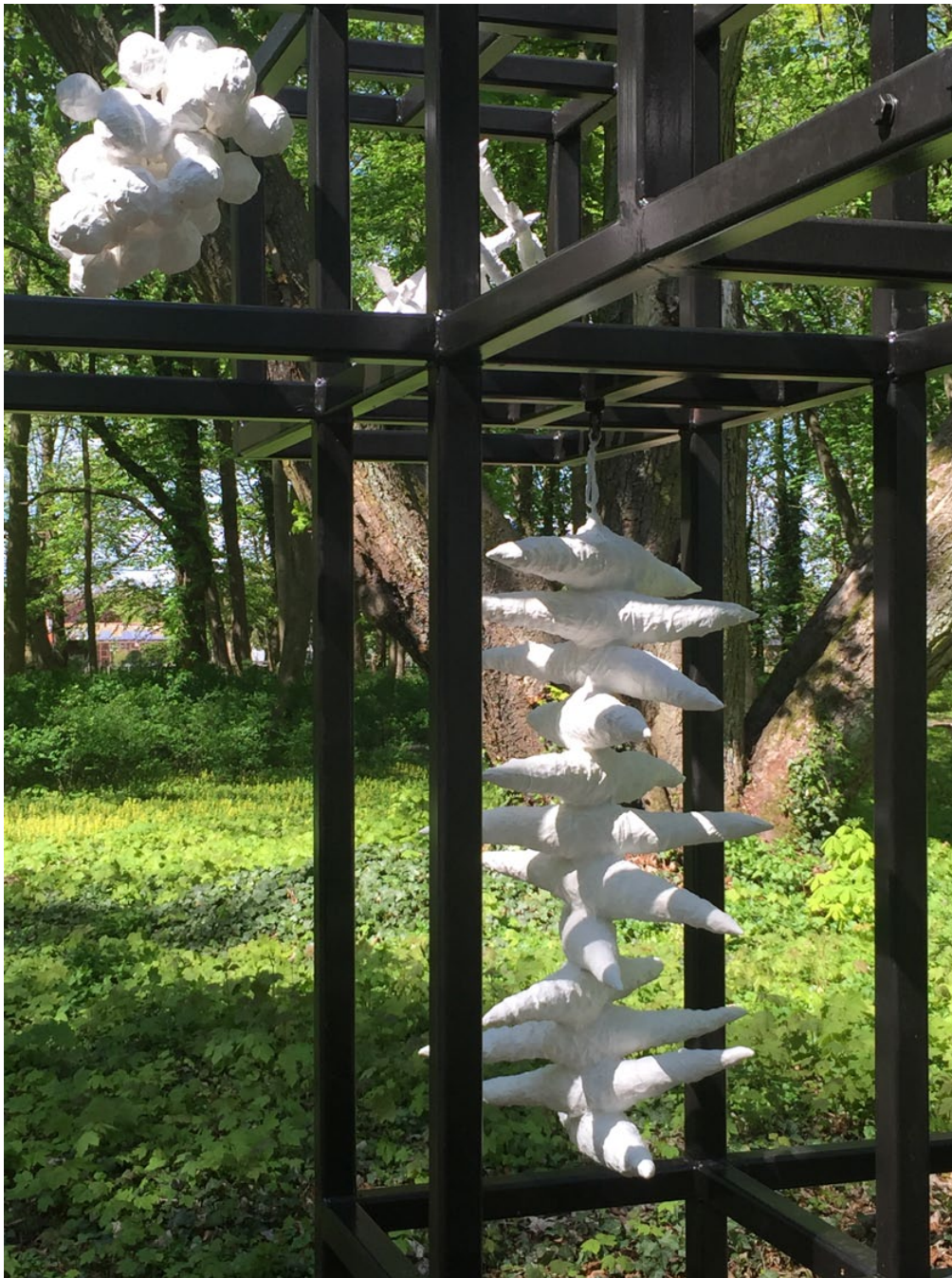
Land Art Schlosspark Wagenitz Cosmos (detail) 2014/15, size approx. 420 x 400 x 280 cm, various all-wheater materials