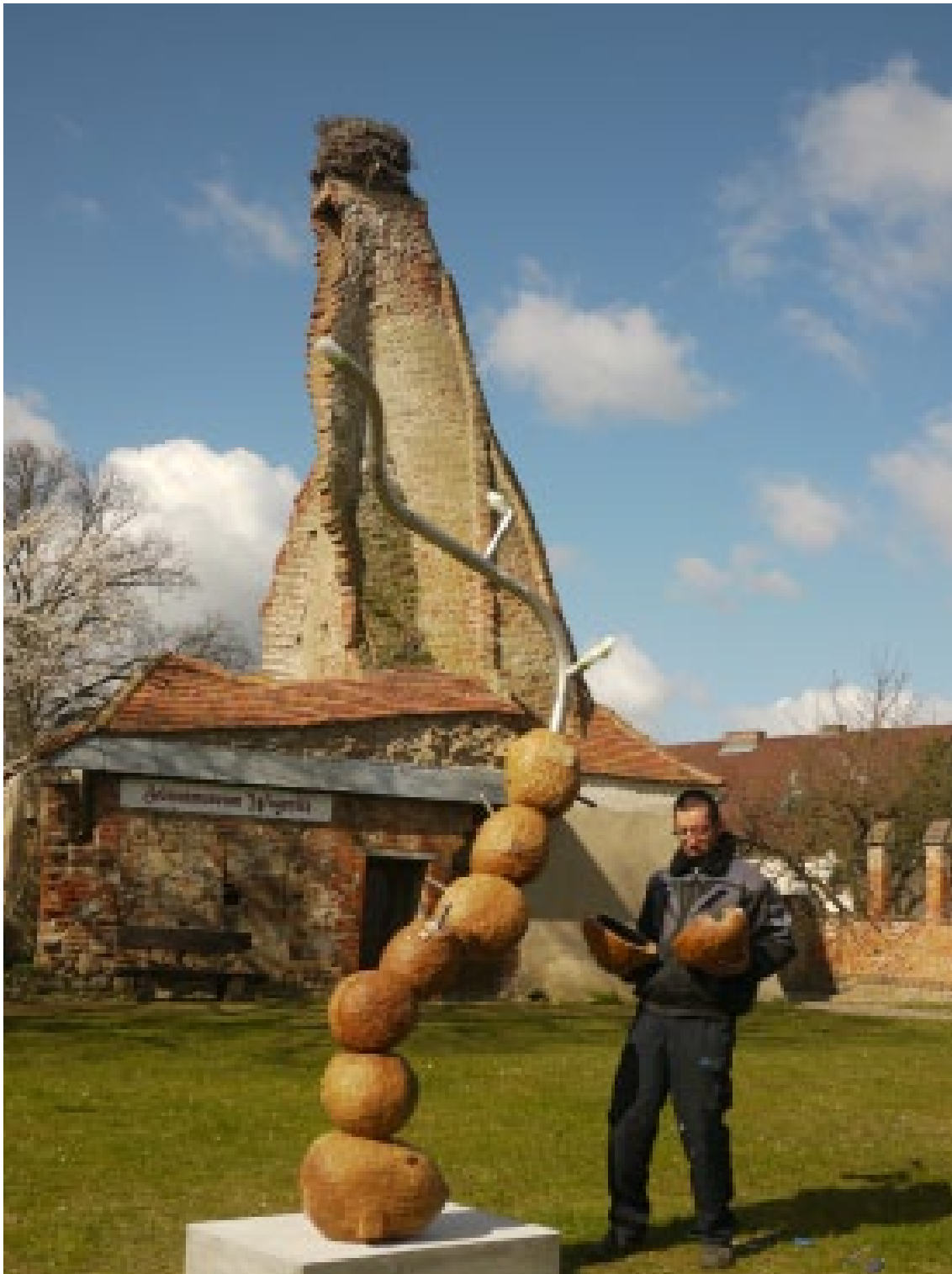
Takayuki Daikoku Installation of the permanent sculpture woodcell for the village Wagenitz. On view in the background is the so-called Schwedenturm. Foto: Takayuki Daikoku, April 2015