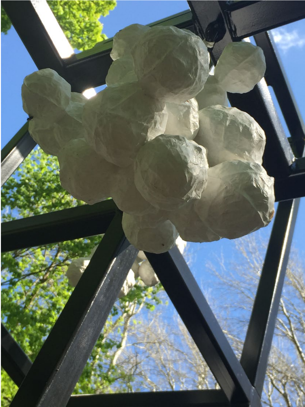
Land Art Schlosspark Wagenitz Cosmos (detail) 2014/15, size approx. 420 x 400 x 280 cm, various all-wheater materials