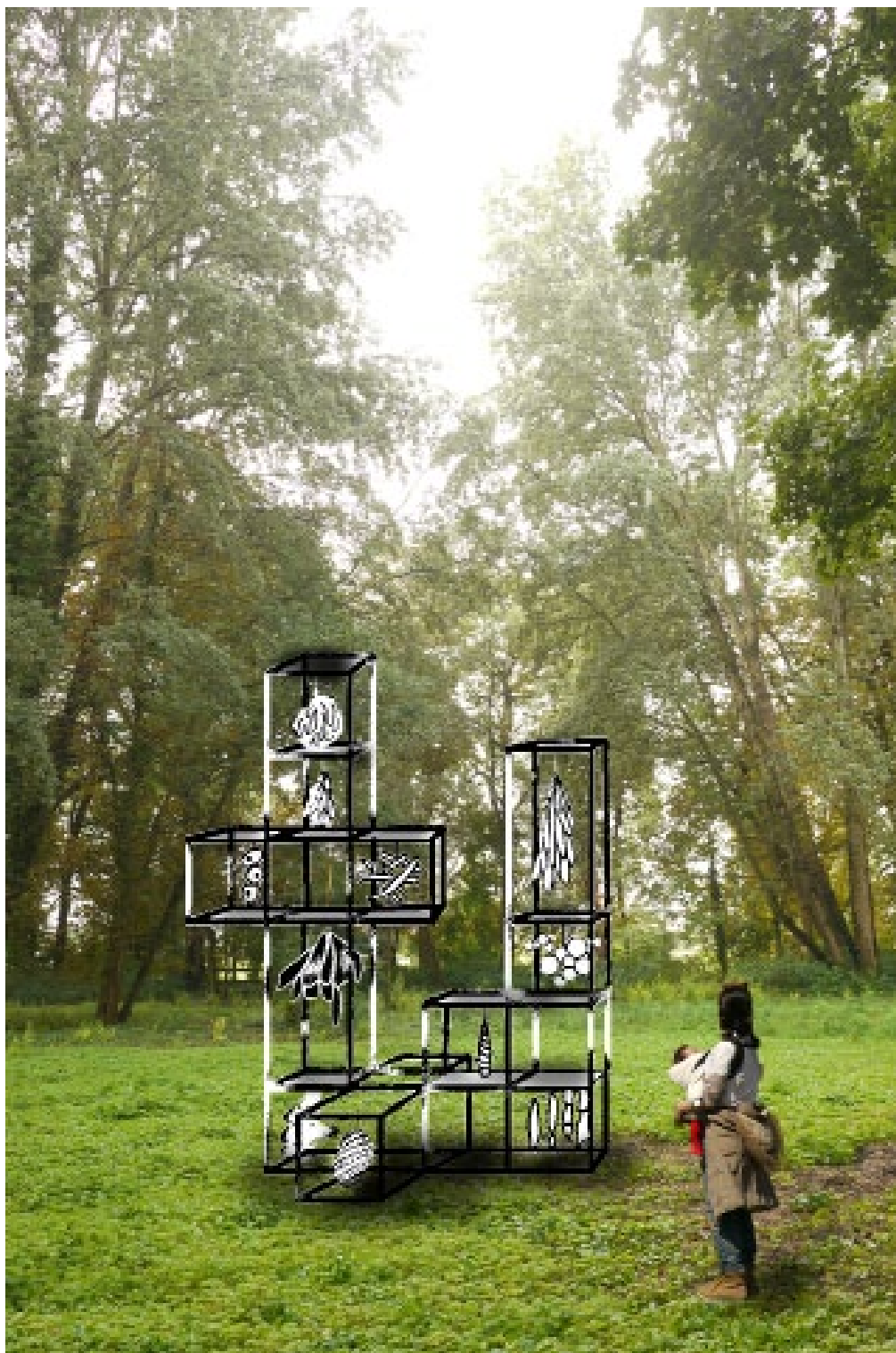
Takayuki Daikoku Design for Cosmos (visualisation) on a clearing of the Schlosspark Wagenitz 2013, size approx. 420 x 400 x 280 cm, various all-weather materials