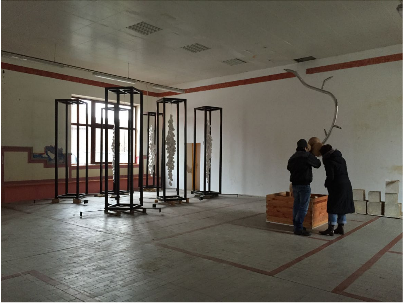
Takayuki Daikoku Studio view during production process of woodcell for the village green of Wagenitz. In the rear: all 6 renmen ( outdoor ) sculptures, also in w.i.p. January 2015