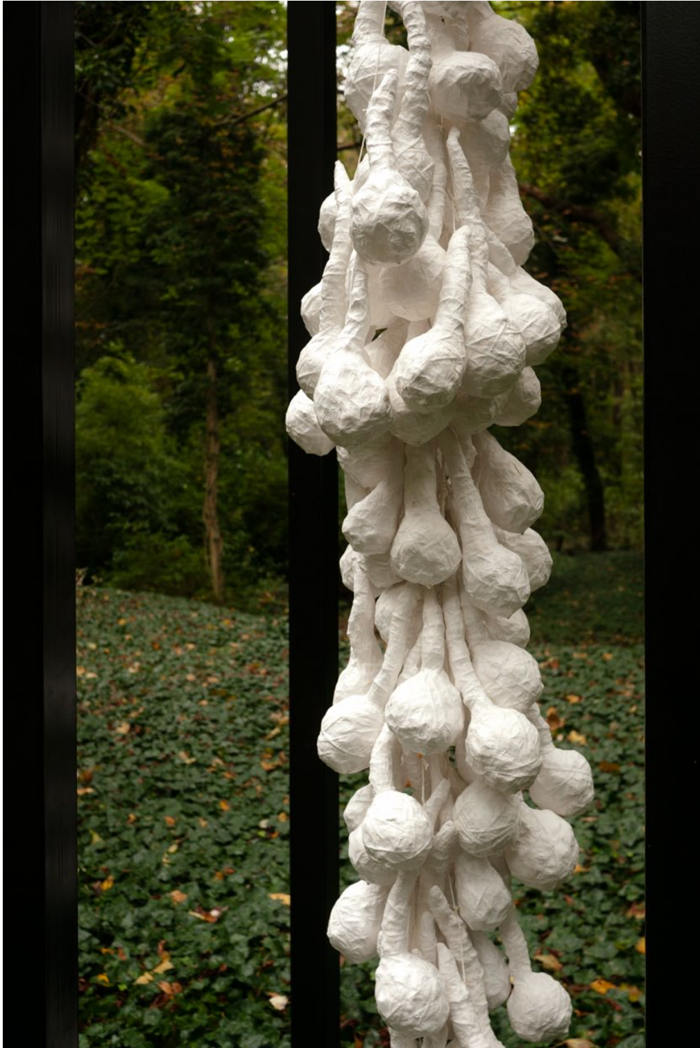
Takayuki Daikoku Photography (*) renmen (outdoor) – 2 2014, 100 x 70 cm, Fine Art Print (pigment print) on Hahnemühle Photo Rag 188 g, laminated on Kappafix, edition of 3 (+1) (*) from the provisional installation at Schlosspark Wagenitz in fall 2014