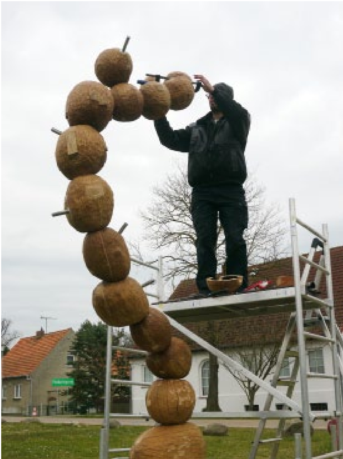
Takayuki Daikoku Installation of the permanent sculpture woodcell for the village Wagenitz. Foto: Takayuki Daikoku, April 2015