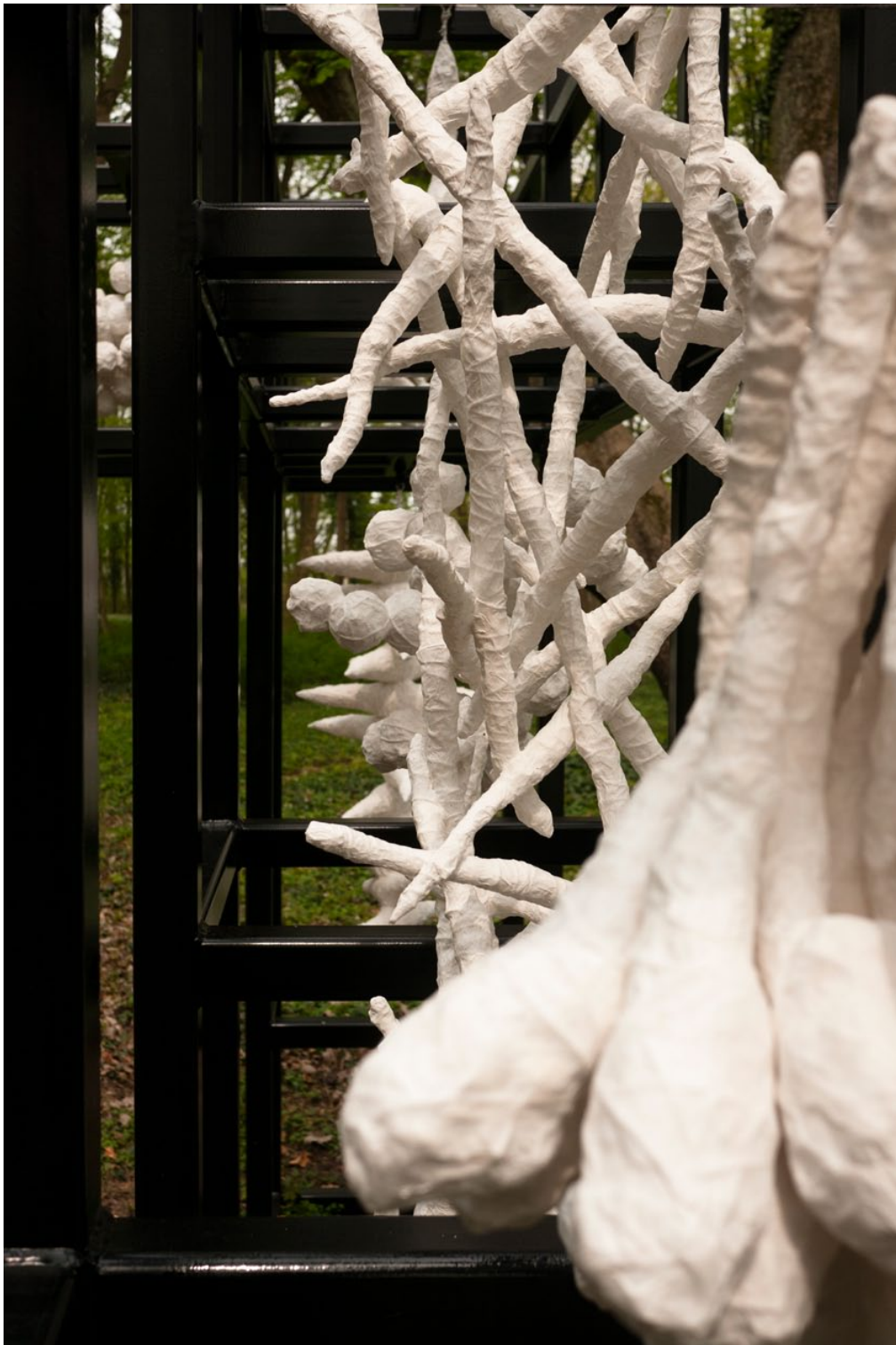
Land Art Schlosspark Wagenitz Cosmos (detail) 2014/15, size approx. 420 x 400 x 280 cm, various all-wheater materials

SEMJON CONTEMPORARY GALERIE FÜR ZEITGENÖSSISCHE KUNST