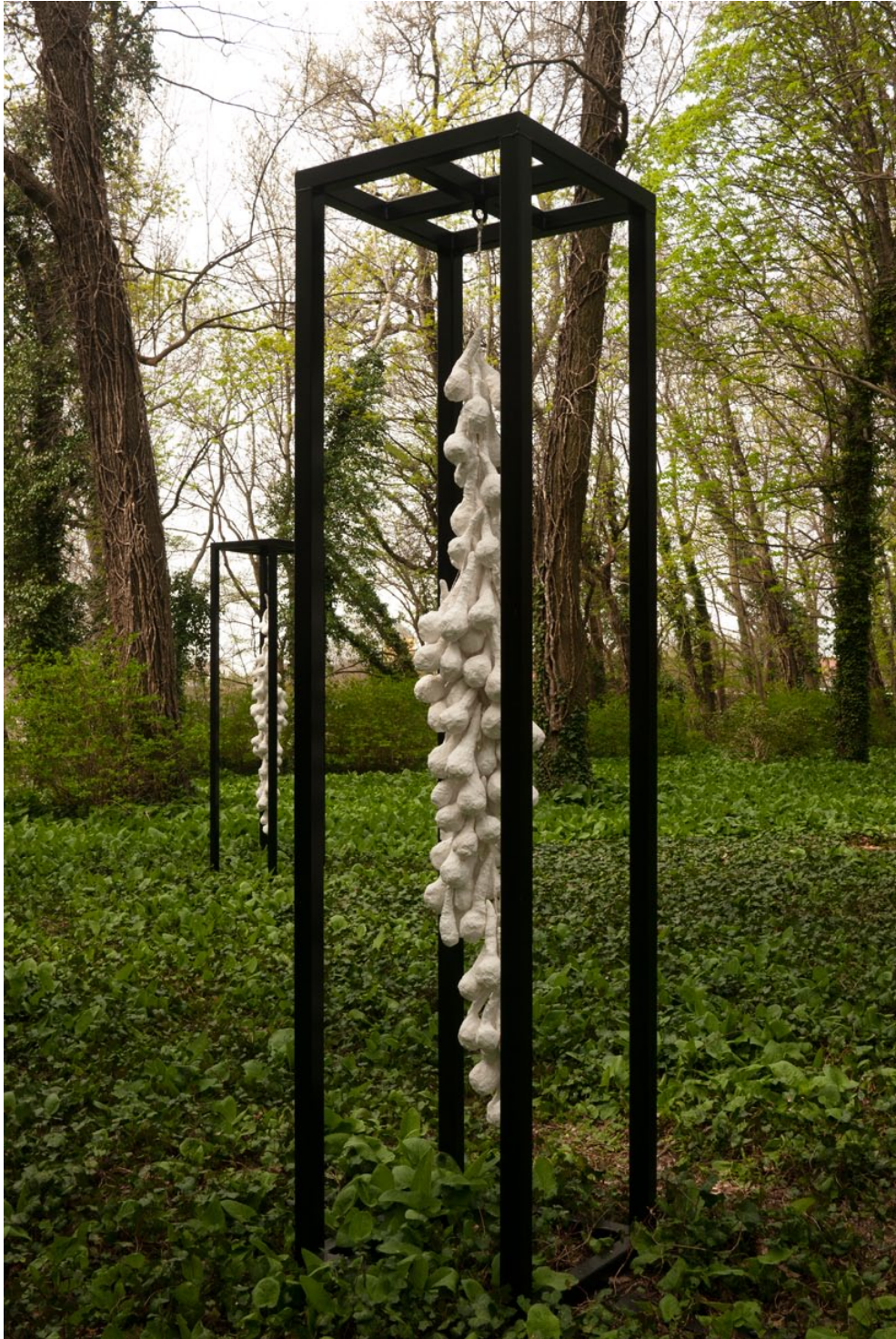
Land Art Schlosspark Wagenitz renmen-Ensemble (outdoor) Each 2014/2015, 300 x 72 x 72 cm, varnished steel, newspaper, cord, Japanese paper, various varnishes; photo: Takayuki Daikoku

SEMJON CONTEMPORARY GALERIE FÜR ZEITGENÖSSISCHE KUNST