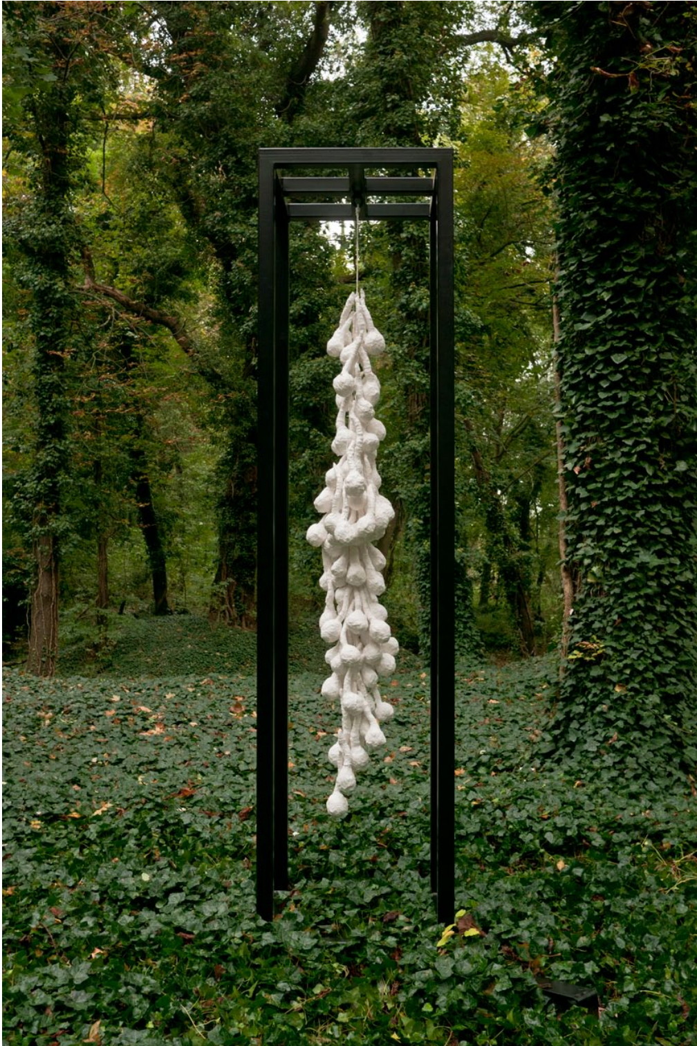
Takayuki Daikoku Photography (*) renmen (outdoor) – 1 2014, 100 x 70 cm, Fine Art Print (pigment print) on Hahnemühle Photo Rag 188 g, laminated on Kappafix, edition of 3 (+1) (*) from the provisional installation at Schlosspark Wagenitz in fall 2014

SEMJON CONTEMPORARY GALERIE FÜR ZEITGENÖSSISCHE KUNST