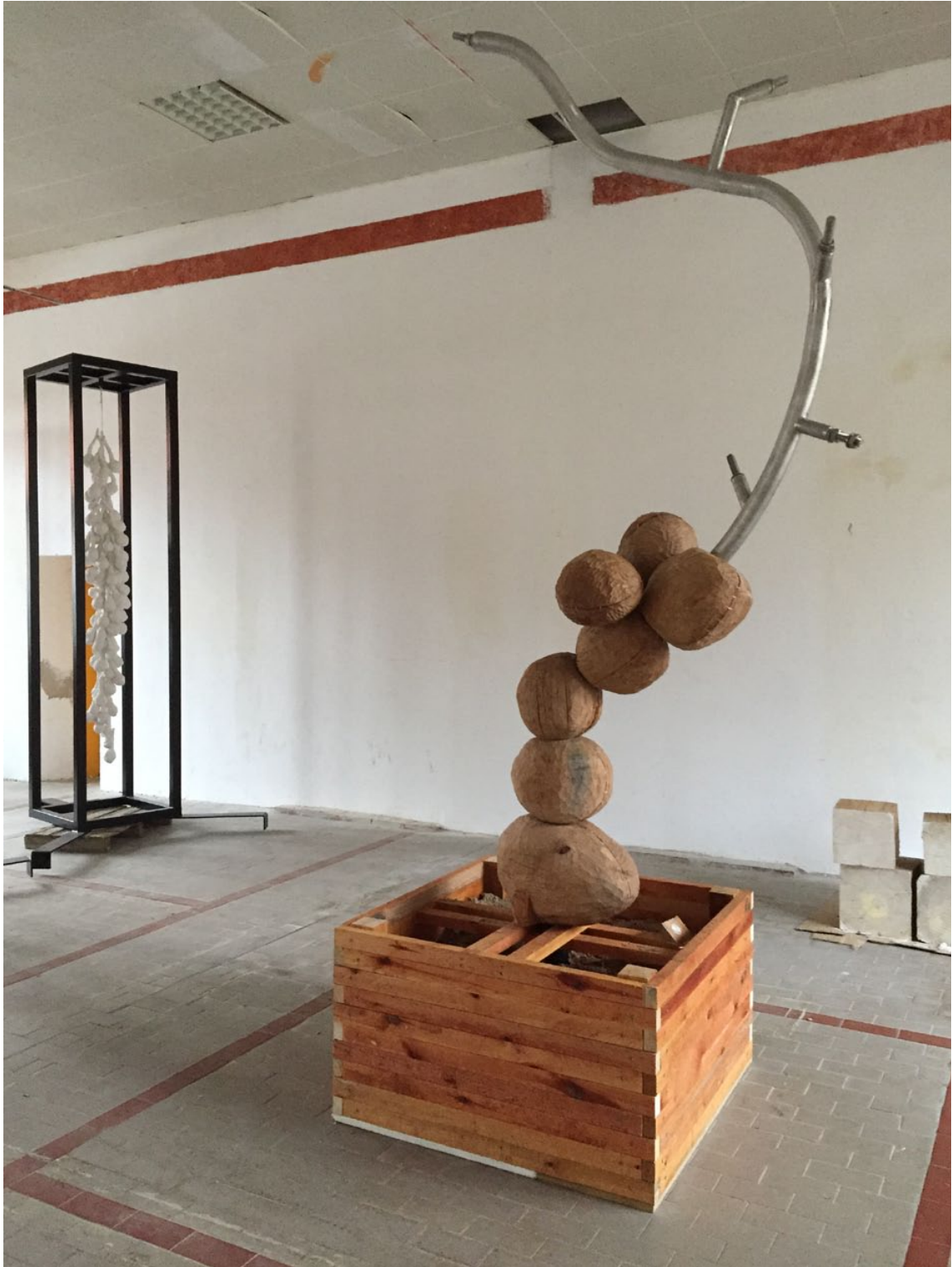
Takayuki Daikoku Studio view during production process with woodcell for the village green of Wagenitz. In the rear: an almost finished renmen (outdoor) sculpture. January 2015